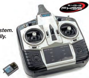
Model 2 (Left throttle)